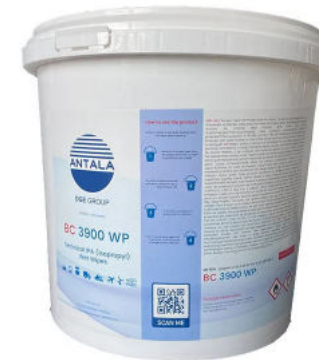
BC 3900 WIPES

Isopropyl wipes for surface cleaning prior to bonding, sealing and lubrication applications to ensure uncontaminated surfaces.