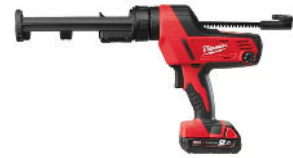
Milwaukee C18PCG Caulking Gun

Product No. 10700013 Suits 600ml sausage