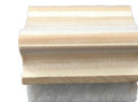
Wool Felt Element Cleaner