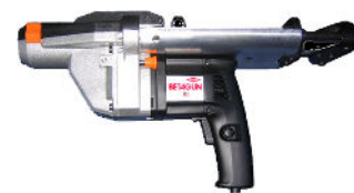
BETAGUN III 2K 240V Applicator

Product No. 24100364 Suits 580ml set (Betamate 2810 & Betaforce 2850, 9050)