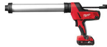
Milwaukee C18PCG Caulking Gun

Product No. 25200037 Suits 310ml cartridge