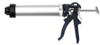
Ultraflow Combi Cartridge Applicator

Product No. 10700005 Suits 310ml cartridge