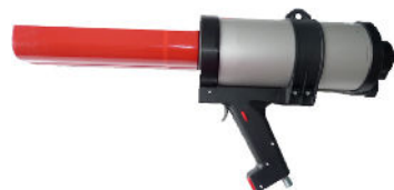
BETAPOWER II 2K Pneumatic Applicator

Product No. 24100364 Suits 580ml set (Betamate 2810 & Betaforce 2850, 9050)