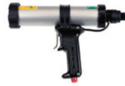
Ultraflow Combi Sachet Applicator

Product No. 10700006 Suits 600ml sausage