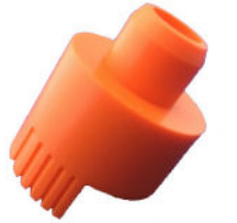
Orange Plastic Applicator Cap