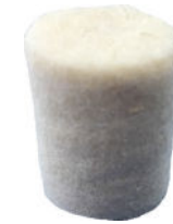
White Wool Felt Applicator