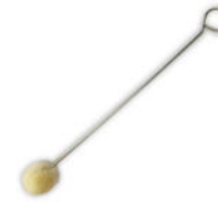
Wire Felt Applicator