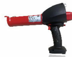
BATTERY GUN FOR BETAMATE 2810

Product No. 24100364 Suits 580ml set (Betamate 2700 & X2800)